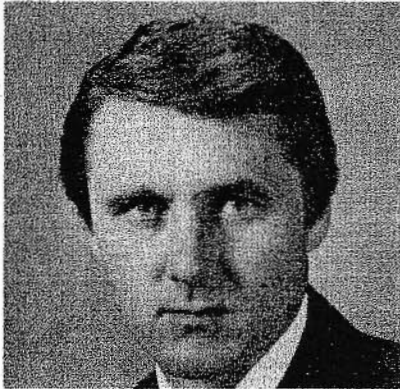
Herb Brooks Head Coach