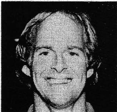
Craig Patrick Asst. Coach & Asst. General Manager

tion. He was a member of the 1964 and 1968 Olympic teams and five times was a player on National teams. Brooks, who also coached the '79 National team at the World Ice Hockey championships in Moscow, feels the 1980 team will be able to compete against the top teams in the world. "I think this young squad can compete with the best in the world given proper preparation and that is what our staff is designed to deliver to our men: A chance to take on the best in the world in a truly international sport."