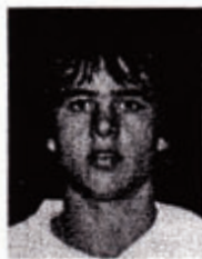
9 Neal Broten

Captain of the University of Minnesota national championship team last year. The Grand Rapids native was an All-American selection in 1979 and was named first team all-WCHA the past two seasons. He lettered four years under Herb Brooks and was also a member of the Gophers' 1976 national championship club. He currently holds two season records at the U of M — most points by a defenseman (54) and most assists by a defenseman (42). An excellent student, he has been accepted to the University of Minnesota's Dental School and was the recipient of the conference medal last year — symbolic of the school's top student-athlete. Played in three state tournaments including Grand Rapids' first state title team in 1975.