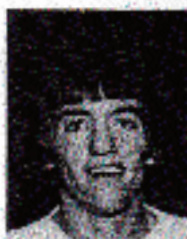
10 Mark Johnson

Played four seasons and lettered in three under Herb Brooks at the University of Minnesota. His stalwart goaltending led the Gophers to a national title last year as he was named MVP of the NCAA tournament. In WCHA play last year, he placed second with a 3.53 goals against average and a 17-10-1 win-loss record. He was named honorable mention in the Denver Post's all-WCHA team in his junior year. Had great prep career at Hill-Murray — he was named All-state twice, All-American once and led his team to a state tourney berth in 1975. He earned 10 prep letters in football, hockey, golf and soccer. He is majoring in Chemical Engineering.