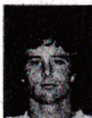
24 Rob McClanahan

Played three seasons at the University of Wisconsin under the coaching guidance of his father, Bob Johnson, who also coached the 1976 U.S. Olympic team. Mark finished second in WCHA scoring last year with 28 goals and 41 assists, one point behind League leader and Olympic teammate, Dave Delich. Since 1976 when he began his collegiate career at Wisconsin he has received the following honors: All American (1978 & 79); first team WCHA (1978 & 79); WCHA Outstanding Freshman (1977); WCHA MVP (1979); and College Player of the Year (1979). Played on 1978 & 1979 U.S. National teams. Prior to college hockey he played three seasons for Madison Memorial High School and led it to a state title in 1976.