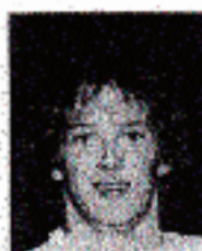
17 Jack O'Callahan

Four year letter-winner from Boston University where he captained the Terriers the past two seasons. He was a first team All-American selection last year and was the main cog in leading BU to a national title in 1978. He had six assists in the NCAA championships that year and was named MVP of the tourney. Other honors he garnered while at BU were: all-ECAC (1978 & 79), New England's outstanding defenseman (1978 & 79), MVP Beanpot Tournament (1978), and BU's top student athlete in 1978. Played on 1978 & 1979 U.S. National teams. Attended Boston Latin High School where he earned all-city and all-scholastic honors. Majored in American History and plans to pursue a business or law career.