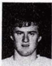
23 Dave Christian

Played three seasons at Boston University and led the Terriers to an NCAA title in 1978. He was an All-American selection last year and was also named all-East and all-New England. Had an outstanding World Tournament while playing for the U.S. National team in Moscow last year. Picked by Atlanta Flames in fourth round of 1976 NHL amateur draft. Prior to Boston University he played one season for Massoit Community College in Massachusetts. He is a native of North Easton, MA, where he was a high school all-state and all-scholastic performer. He is a Social Education graduate.