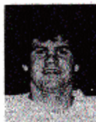
21 Mike Eruzione

A 1977 graduate of Boston University and is currently the school's second all-time leading scorer with 208 points. The past two seasons he played in the International League for Toledo, where he was named the American rookie-of-the-year in 1978. While at Boston University he was named outstanding defensive forward for four years, was an ECAC all-star for three years, and made the all-New England team three times. Was a member of the 1975 (Munich) and 1978 (Katowice, Poland) U.S. National teams. A native of Winthrop, MA, where he starred in hockey, football and baseball. A Physical Education major.